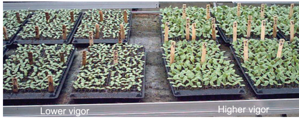
Figure 2 – Melon seedling emergence from two seedlots with differences in vigor when exposed to thermal stress after sowing. (Marcos-Filho et al., 2006). Just after sowing seeds were exposed to 18 °C for three days and then kept at 25 °C for subsequent germination. Seedlings from lower vigor seeds were adversely affected by suboptimal temperature in contrast with those of higher vigor.

seedling emergence or greater storability. Seed vigor can be considered an abstract characteristic and this expression was probably introduced to “fill a slot” owing to the absence of effective parameters to elucidate frequent questions about seed performance under less favorable conditions.