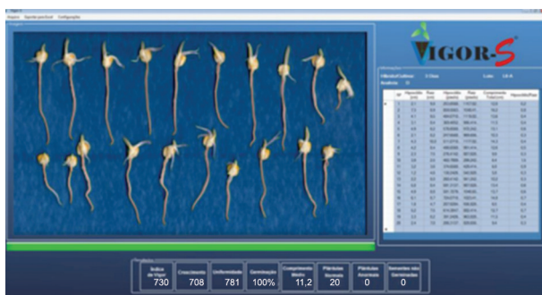
Figure 5 – Analyzed image of a corn seedling sample by Vigor-S with indications of vigor index, uniformity of seedling growth, seedling length and, on the table, coleoptile and root lengths, seedling length and a ratio of coleoptile/root length.

The estimation of field seedling emergence is not an easy task. The results of vigor tests can be expressed in different units, and the information produced by a single vigor test is only comparative. Moreover, it is reasonable to consider that only one test cannot detect all possible facets of seed performance, since most accepted concepts of seed vigor refer to a "sum of all those properties" and not a unique characteristic. At the same time, the environment increases the degree of complexity of factors affecting seed performance. Thus, the information provided about seed vigor should be based on the interpretation of results of two or three tests whose principles might be closely related to the desired objectives. The direct influence of seed vigor on seedling establishment in the field and on