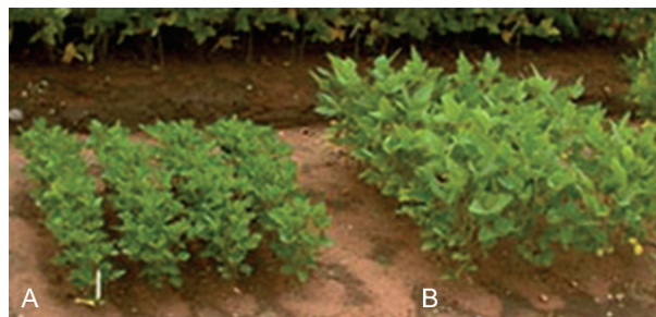
Figure 1 – Initial development of soybean seedlings of the same age from a lower (A) and higher (B) vigor seedlots, showing clear difference in performance.

These current accepted concepts do not include the possible persistence of the effects of seed vigor throughout the plant development cycle persisting until yield. It may well be that the emergence of vigorous seedlings can result in high crop productivity because of rapid and uniform stand establishment. Moreover, the term vigor cannot be identified as a single seed physiological process, but usually lead to improved